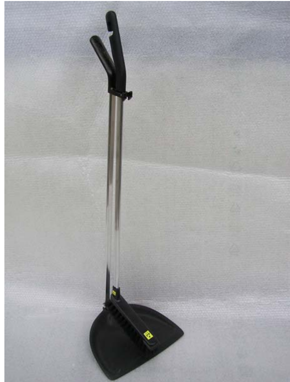
TABLE BRUSH TEX-50ESD

For cleaning tables and shelves. Conductive, volume loaded material.